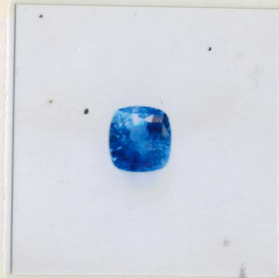
Photograph of tested item not actual size